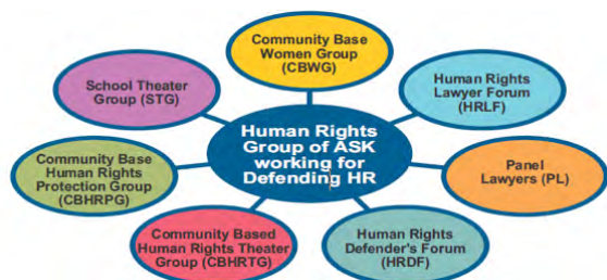
Figure-3: Partnership network of ASK

Presently its programmes are operated through 14 NGOs and CBOs, 20 Schools and 10 Human Rights Defenders' Forums (HRDF). Moreover, ASK has close liaison and partnership with national and international forums for advocacy. The following figure shows the partnership structure of ASK.